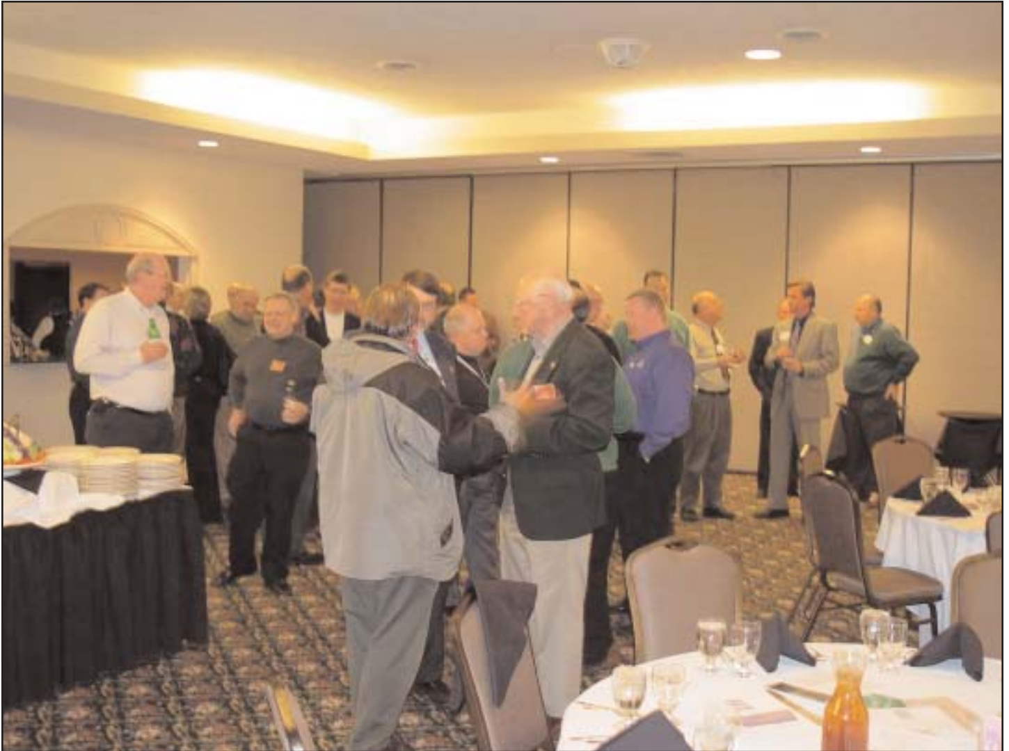
Ambient crowd scene prior to the main event.